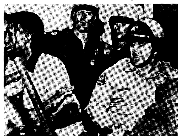
Los Angeles Police in Watts